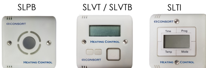
SL wireless controllers

Reasonable care has been taken to ensure that this guide is accurate at the time of printing. In the interest of progress, the Company reserve the right to vary specifications from time to time without notice.