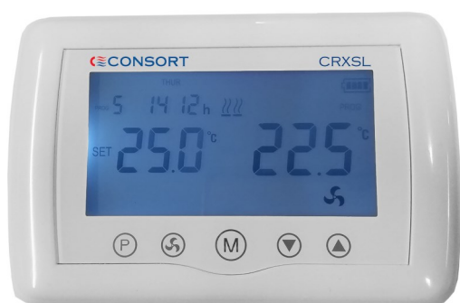
CRXSL wireless controller

This heater can only be used in conjunction with a CRXSL wireless programmable controller. Each CRXSL can control any number of heaters in the same room.